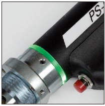
PS-9螺柱焊枪带指示灯 (专利号: 20 2009 01 2 370.7)