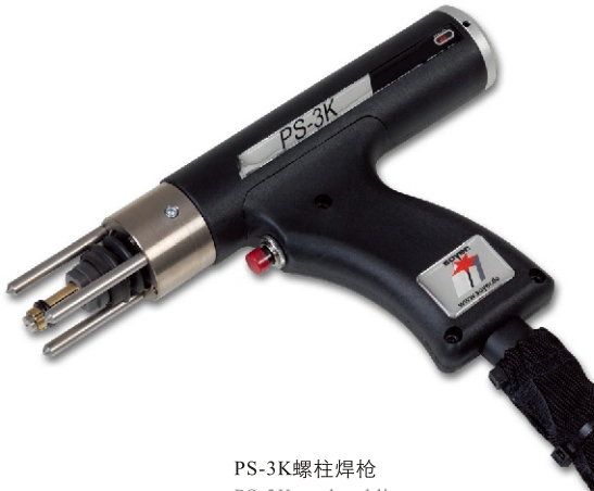
PS-3K螺柱焊枪 PS-3K stud welding gun