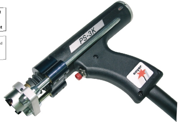
带支撑的PS-3K螺柱焊枪 PS-3K stud welding gun with support